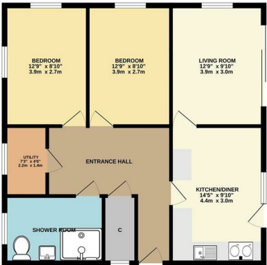
TOTAL FLOOR AREA: 753 sq.ft. (70.0 sq.m.) approx. We have obtained this figure from the Land Registry and the Ordnance Survey. It is an estimate of the area and does not constitute a guarantee of accuracy. It is intended to provide a general indication of the size of the property and is not to be relied upon for legal purposes. The actual area may vary slightly from the figure shown.